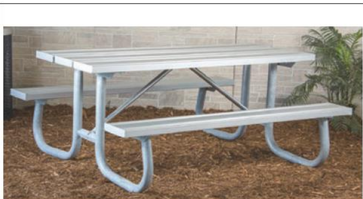
Shown: 6J2GA Aluminum