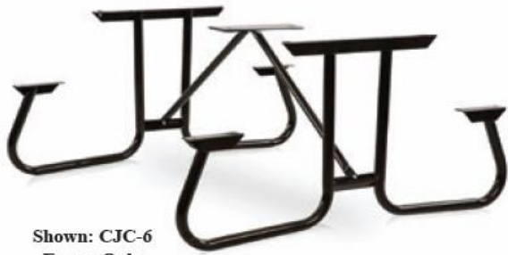
Shown: CJC-6 Frame Only