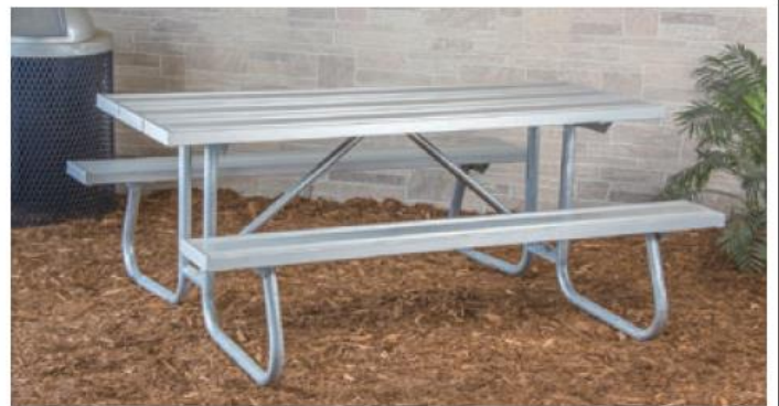
Shown: 6CJGA Aluminum

WARNING: Cancer and Reproductive Harm www.P65Warnings.com