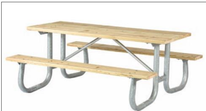
Shown: 6J2GW Wood

WARNING: Cancer and Reproductive Harm www.P65Warnings.com