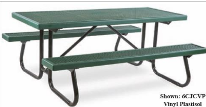
Shown: 6CJCVP Vinyl Plastisol