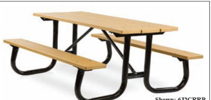
Shown: 6J2CRRP Recycled Plastic