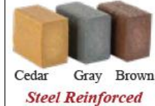
Cedar Gray Brown Steel Reinforced

WARNING: Cancer and Reproductive Harm www.P65Warnings.com