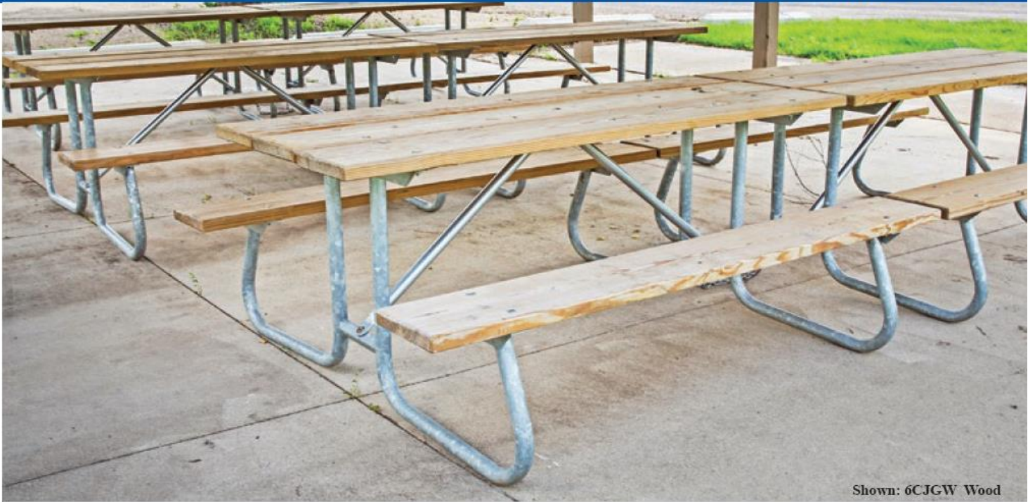
Shown: 6CJGW Wood