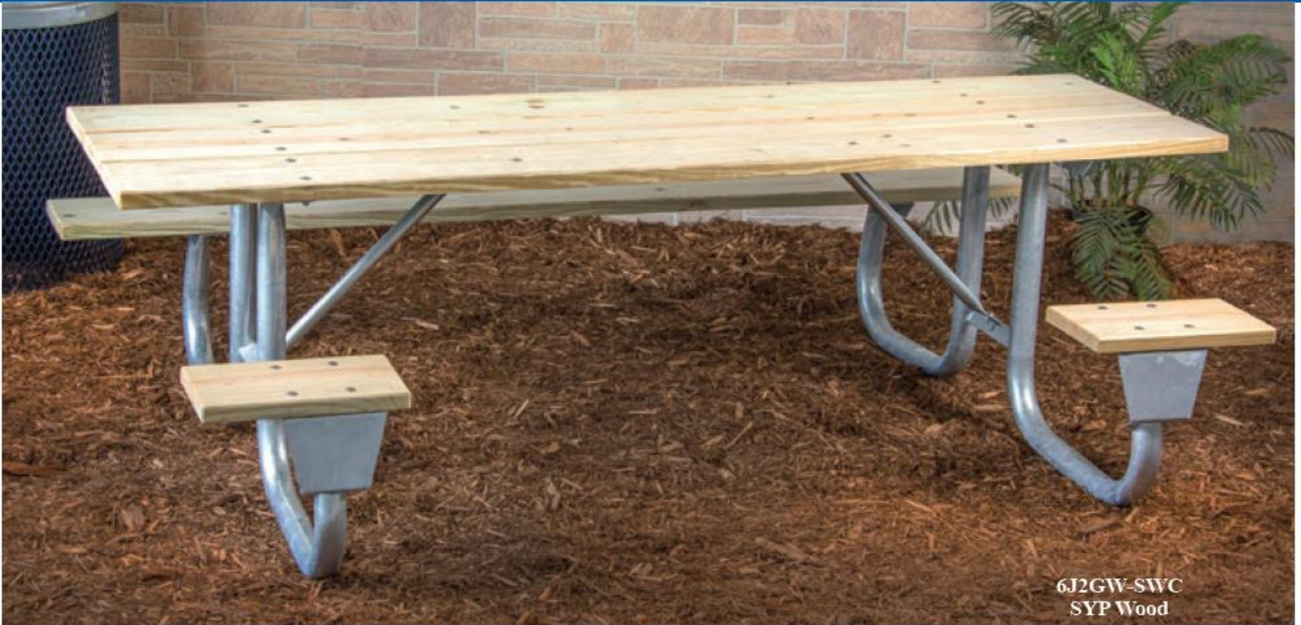
6J2GW-SWC SYP Wood