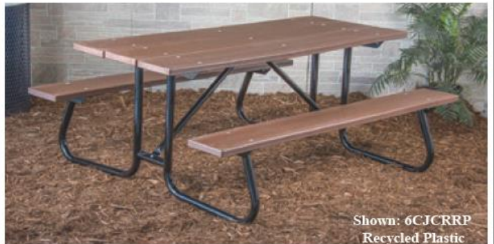
Shown: 6CJCRRP Recycled Plastic