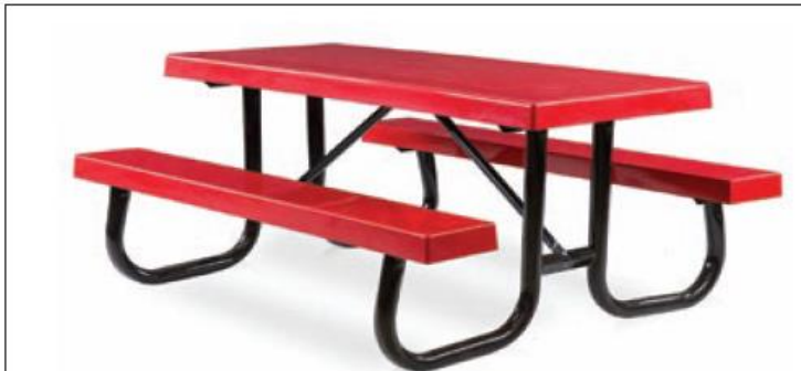
Shown: 6J2CF Fiberglass