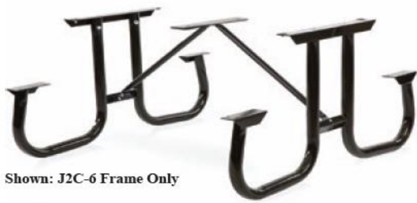
Shown: J2C-6 Frame Only