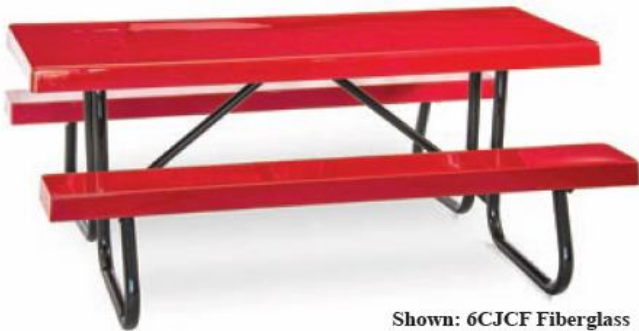
Shown: 6CJCF Fiberglass