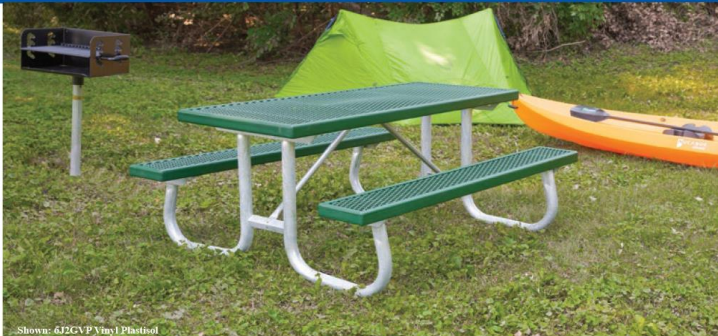
Shown: 6J2CVP Vinyl Plastisol